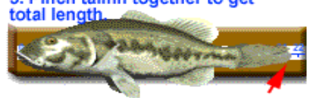
Photo #2 Make sure you can read the measuring device to the nearest 1/8".

3. Pinch tailfin together to get total length