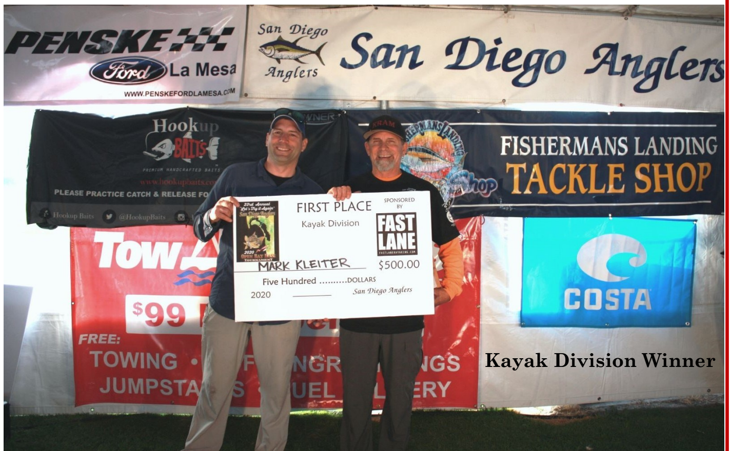
Kayak Division Winner