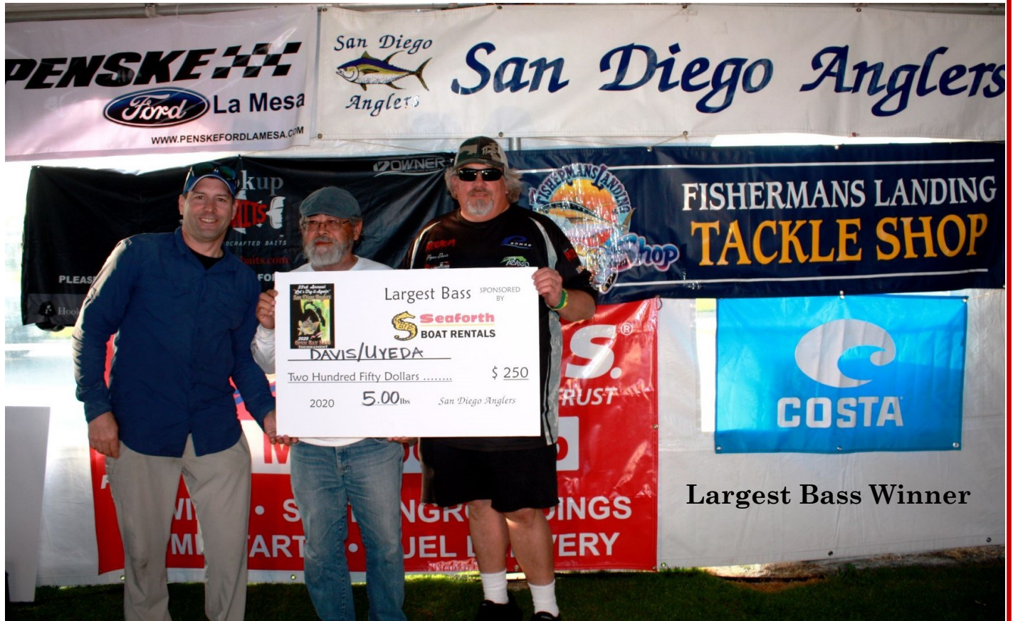
Largest Bass Winner