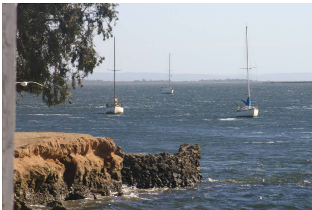
BAY OF SAN QUINTIN, BAJA MEXICO

Tournament Info, Rooms, RV Spaces, Boat Charters Info: